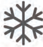
Freeze Thaw Vertical