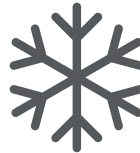
Freeze Thaw (Pending Testing)